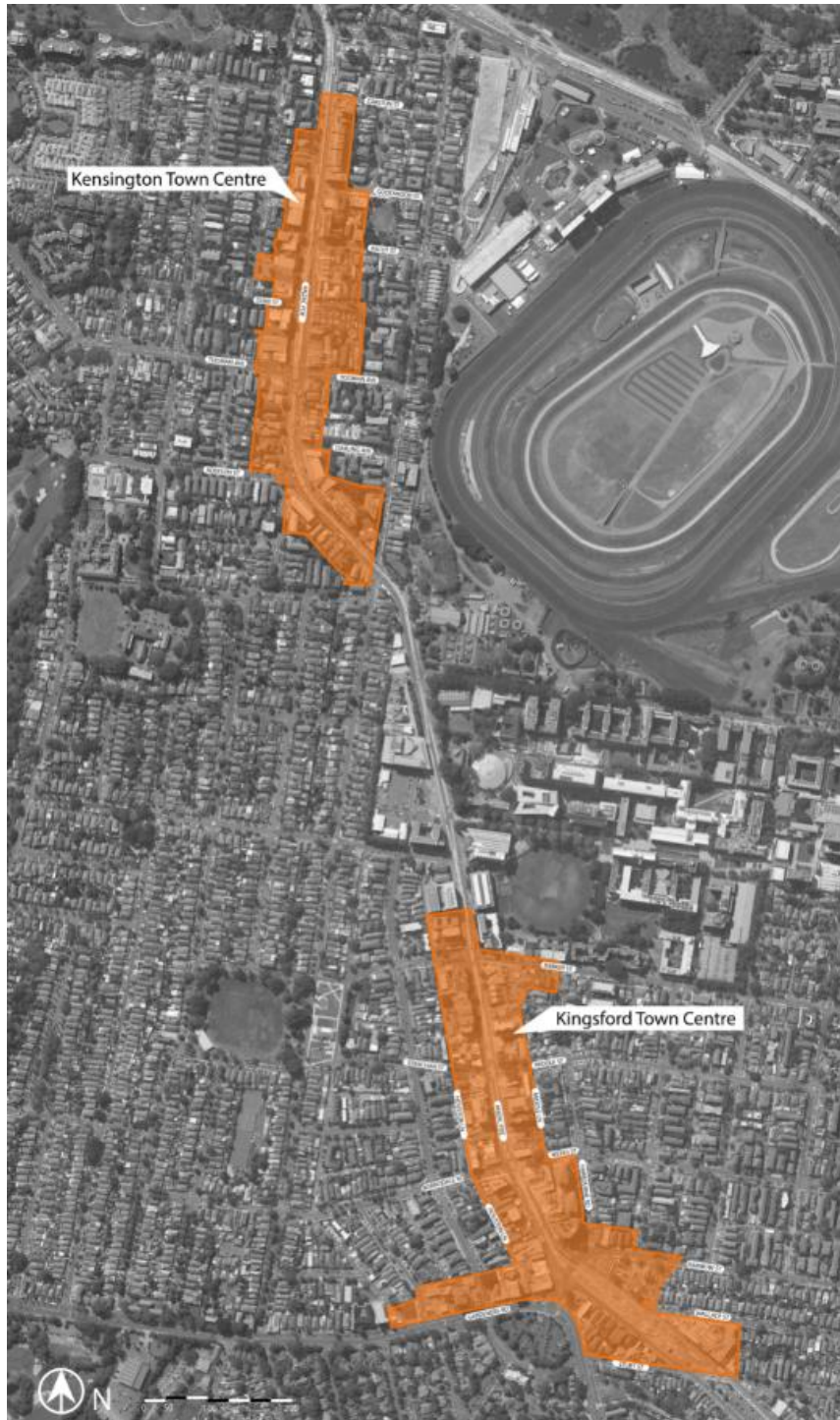
Figure 1. Kensington and Kingsford town centres boundary (highlighted red)(to be updated)

The Kensington and Kingsford town centres are shown in Figure 1 below.